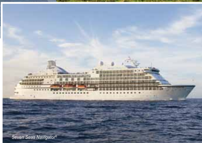
Seven Seas Navigator®