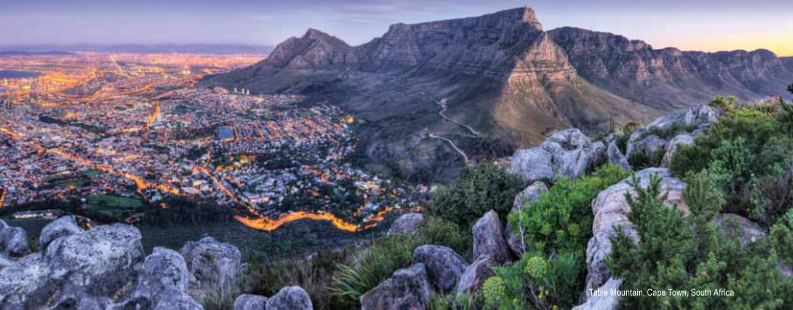
Table Mountain, Cape Town, South Africa