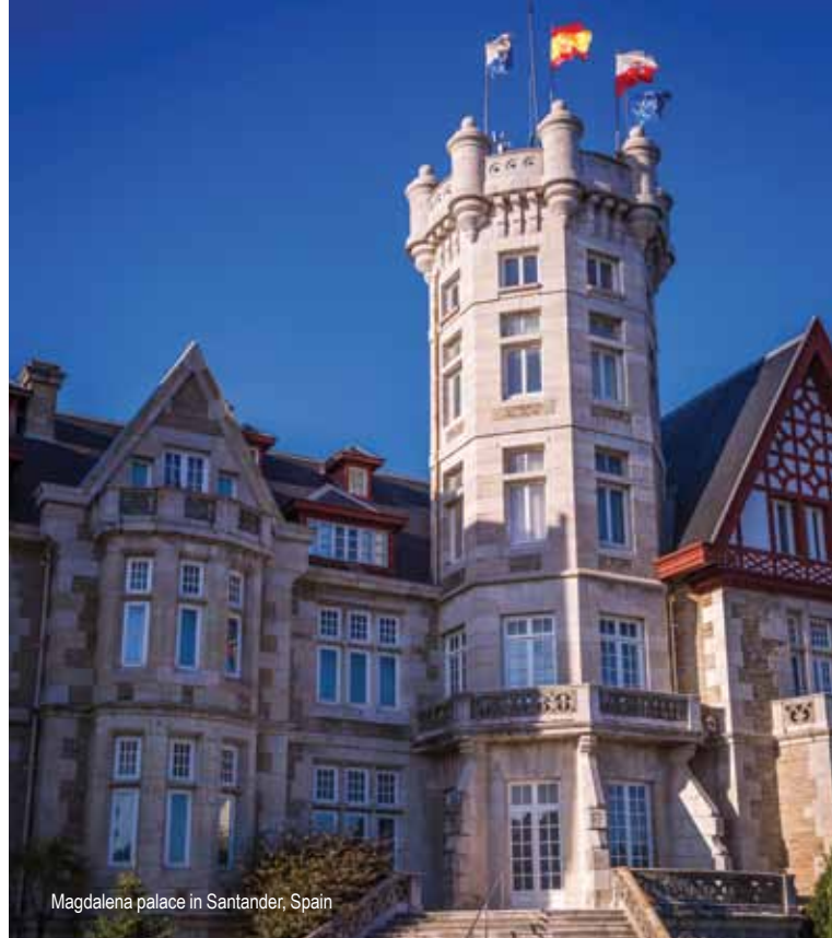
Magdalena palace in Santander, Spain