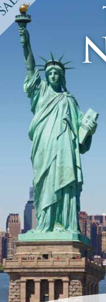
New York, USA